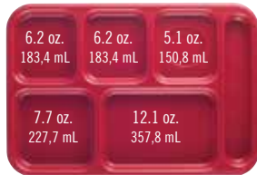
BCT1014, PS1014 & 10146CW